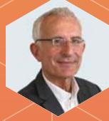
Guillaume Pepy Director